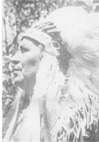
BIG WHITE OWL

On March 1, 1954, The Canadian Red Cross Society will launch its national appeal for funds. The goal set this year for Canada is $5,422,850.