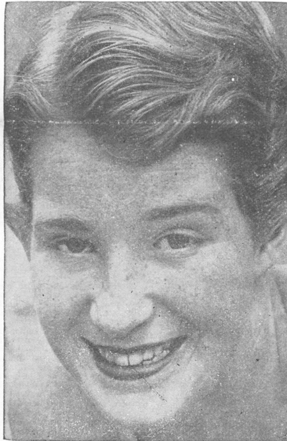
CANADA'S MARILYN BELL

So very few people have ever really tried to understand and make friends with the spirit of a great blue lake. To most everyone, it is just a huge body of fresh, cold, blue water and nothing more. Often men abuse it and deliberately taint its majestic beauty. Yet, whenever a lonely mortal wanders along the shrine of its